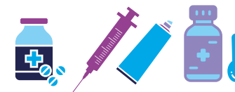
Medication (If needed)