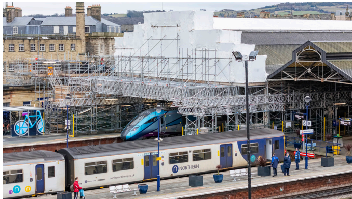
Two trains sit at Huddersfield station, with the roof encapsulated for restoration works

In Huddersfield, the work to upgrade the station continued, with engineers completely dismantling the station's listed tearoom in 8,000 different pieces and carefully stored away ahead of being reinstated in the future.