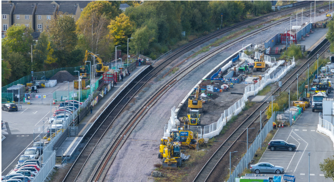
An aerial shot of Mirfield station