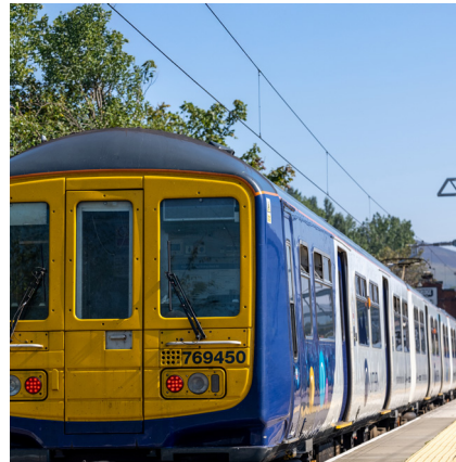
A Northern train at Stalybridge having just used the electric wires

The programme was also granted a Transport and Works Act Order (TWAO) to bring further upgrades to the route between Leeds and Micklefield.